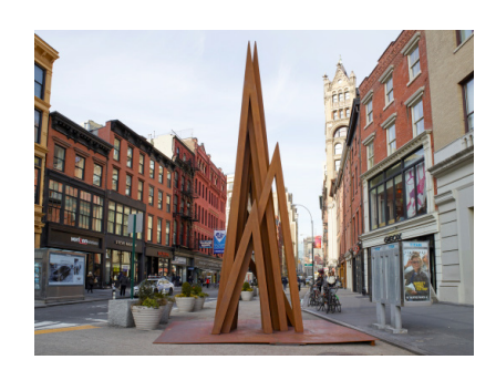
2016 Disorder: 9 Uneven Angles, Bernet Venet Paul Kasmin Gallery