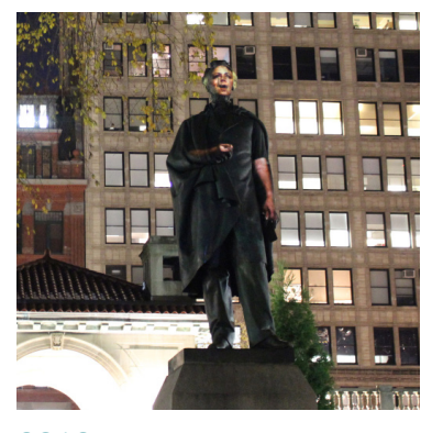
2012 Abraham Lincoln: War Veteran Projection Krzysztof Wodiczko Galerie Lelong and More Art