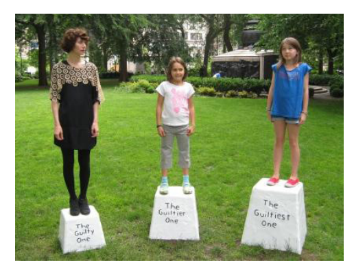
2010 Eleven Heavy Things , Miranda July Deitch Projects