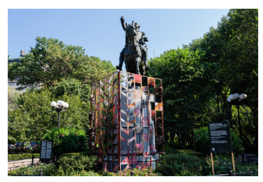
2018 Washington 20/20/20 Kenseth Armstead