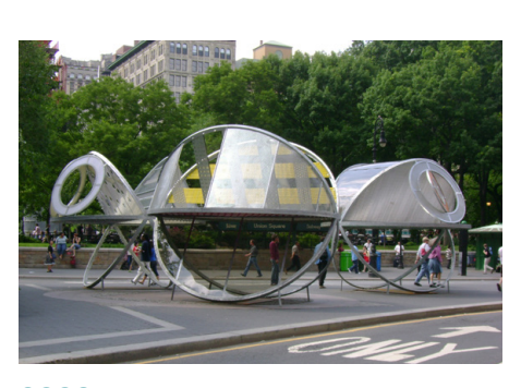
2008 Tumbling Mirages, Dennis Oppenheim Betty Cuningham Gallery