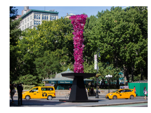
2017 A Rose Crystal Tower, Chihuly Studio Marlborough Gallery