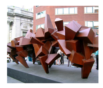
2012 ▲ Microscopic Landscape Malcolm D. MacDougall