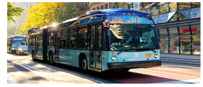
24% increase in weekday M14 ridership and 36% improvement in weekday bus travel times (from November 2018 to November 2019).