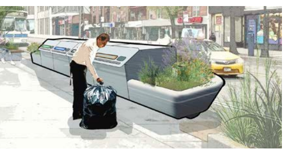
Marvel Architects' proposal for DaRT, the Diversion Recovery Tracking system for waste and recycling containerization and data collection.

Based on the community's feedback, we are planning and visioning for Union Square's future with a focus on urban design strategies to green the district and promote pedestrian-friendly streets. Shown above, Marvel Architects' concept for an expanded sidewalk design.